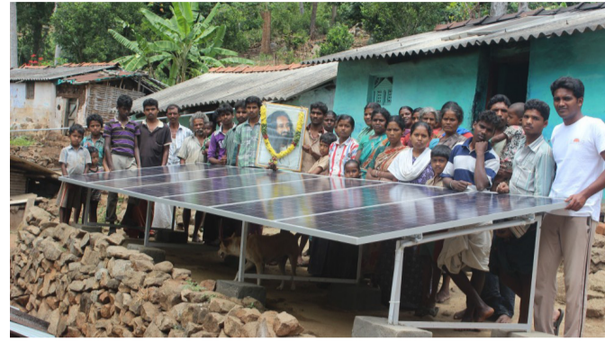
Green tech for poor Above Kadamban Kombai villagers near the newly intalled solar panel. Right is a picture of batteries for solar installation

24 houses in Kadamban Kombai see new light