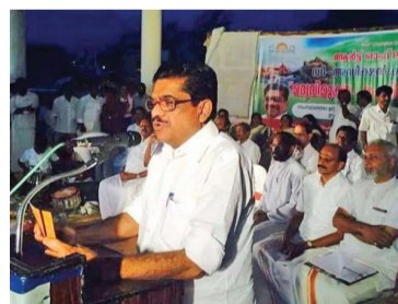
V M Sudheeran, Congress leader, inaugurating the function at Kollam district

One of the leading English dailies recently reported that 74 percent of children are using tobacco. About 40 lakh individuals of the total population are inclined towards different intoxicants such as alcohol, tobacco, Ganja, over The Counter drugs,