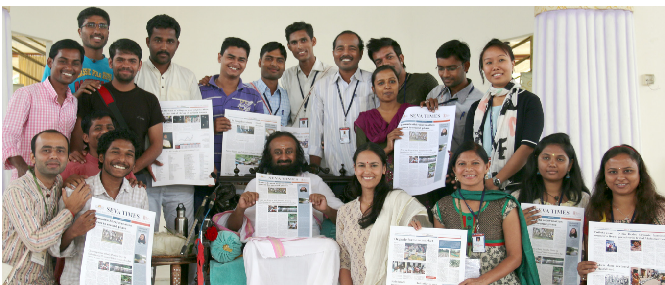
Gurudev launches 'Seva times' with YLTP Media & Documentation Team During Yuvacharya's Refresher Meet (YRM) at Art of Living International Ashram, Bangalore on September 9, 2014

There are two types of joys. One is the joy of getting. The child says, "If I get something, I will be happy. If I get toy, I will be happy." This is the joy if a child. We are mostly stuck at this level and don't seem to grow beyond. But ahead of us is mature joy, the joy of giving.