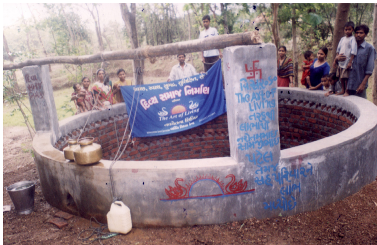
One of the wells constructed at Valsad by volunteers

Art of Living volunteers have found some donors to buy raw materials to build a water tank, on the edge of a natural water source. Earlier, the water used to get dirty and muddy.