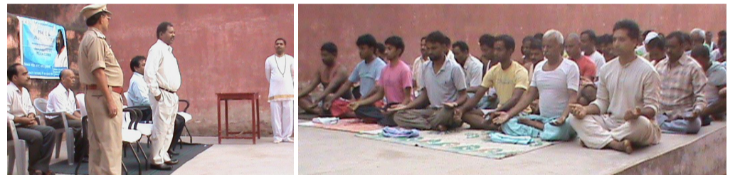
Renewing lives: Prisoners undergoing art of living programmes at Chatra Jail

Under the programme, physical exercises, yoga, pranayama and meditation are taught to the prisoners, which help them to deal with mental and emotional stress. It initiates the prisoners to think positively and lead a normal and happy life after stepping out of jail, said an official of Late-